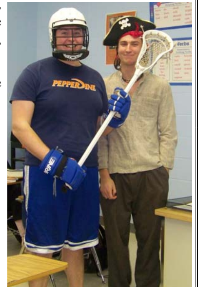
By Meagan Fincham